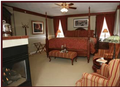
Jacuzzi Room - Sparkling Cascade