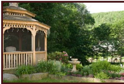
Gazebo and Garden by Ellis River