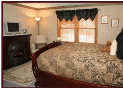
Fireplace Room - Arethusa Falls