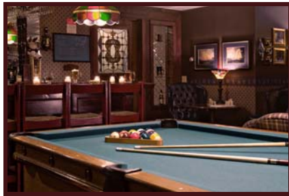
Inn at Ellis River Gameroom/Pub

Awaken to clear mountain air and enjoy a gourmet country breakfast in our sunny dining room. Then explore the area's waterfalls, hiking and biking trails, the 100 mile Scenic and Cultural Byway, or enjoy golf, canoeing, fishing, or horseback riding. In winter, step out the door to world class cross-country ski trails, try snowshoeing, or choose from five alpine ski centers nearby. Finish the day with a romantic sleigh ride. For those seeking a more relaxing day, tax free shopping is nearby in North Conway or just enjoy the inn's distinctive ambiance and let your daily stresses slip away.