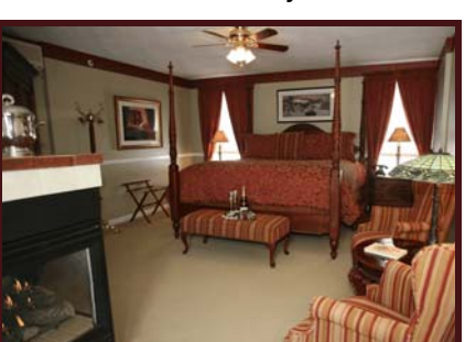
Fireplace Room - Arethusa Falls Jacuzzi Room - Sparkling Cascade